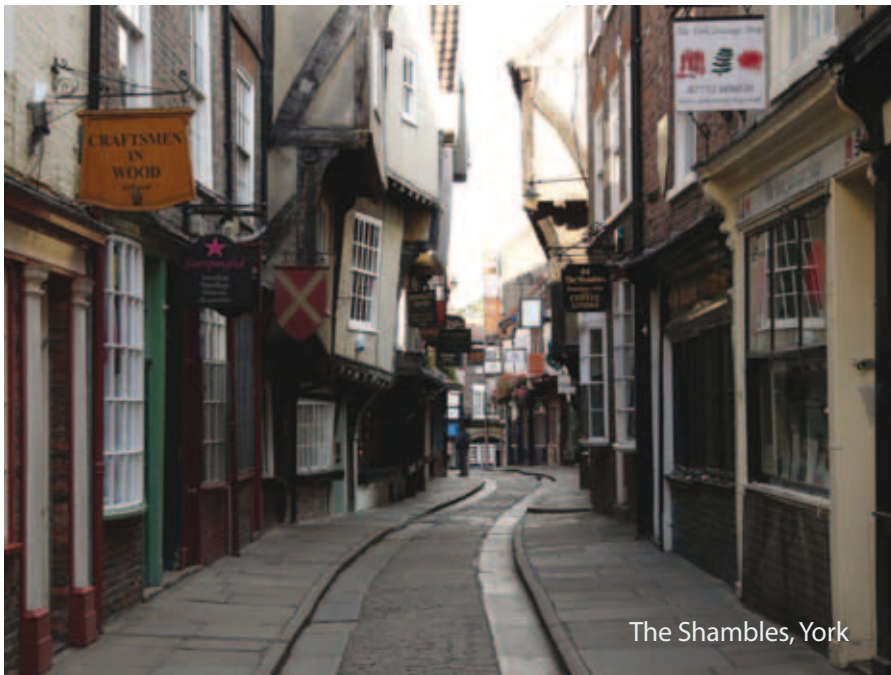
The Shambles, York

thinking are helpful “so you don’t look as if you are rudderless”, although “if you are lost, it can be helpful to say so.”